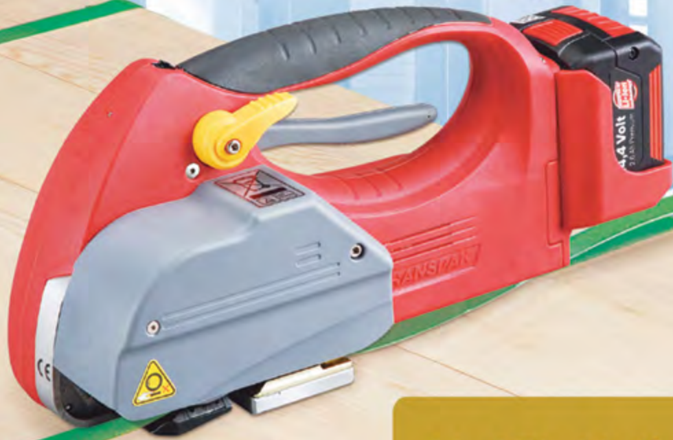
H-45L Helios Power Tool

THE WORLD'S VALUE LEADER A WORLD-CLASS STRAPPING MACHINE COMPANY