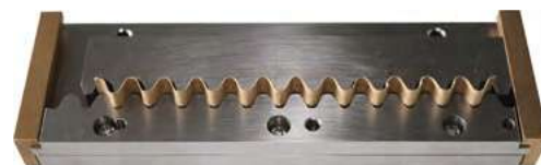
CCT Accesories (PN-CCA)

It is necessary accessories for doing PAT with our crush tester