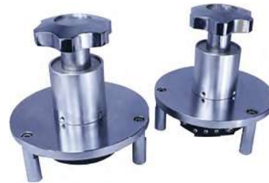
FCT Sample Cutter (PN-FCC 32/64)

It is necessary accessories for RCT using them with our crush tester)