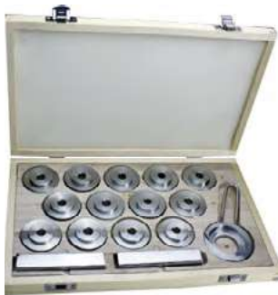
RCT Sample Holder (PN-RCA13)

It is used for cutting corrugated board sample for doing ECT (Edge Crush Test) & PAT (Pin Adhesion Test)