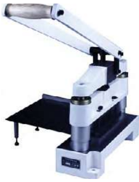
RCT Sample Cutter (PN-RCC152)

It is used for cutting paper sample for doing RCT (Ring Crush Test)