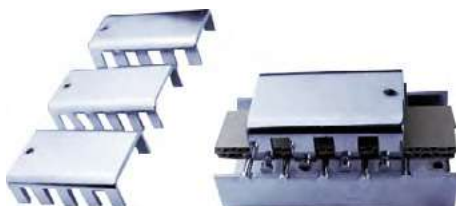
PAT Accessories (PN-PAC)

It is used for corrugated board samples for doing FCT (Flat Crush Test)