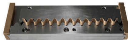
CCT Accesories (PN-CCA)