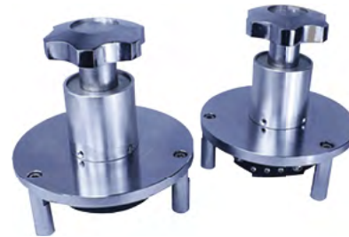
FCT Sample Cutter (PN-FCC 32/64)

It is necessary accessories for RCT using them with our crush tester)