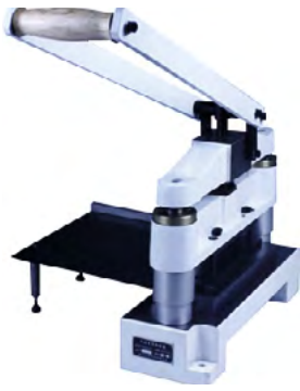
RCT Sample Cutter (PN-RCC152)

It is used for cutting paper sample for doing RCT (Ring Crush Test)