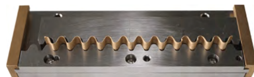
CCT Accesories (PN-CCA)

It is necessary accessories for doing PAT with our crush tester