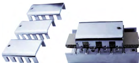
PAT Accessories (PN-PAC)

It is used for corrugated board samples for doing FCT (Flat Crush Test)