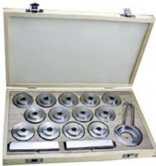
RCT Sample Holder (PN-RCA13)

It is used for cutting corrugated board sample for doing ECT (Edge Crush Test) & PAT (Pin Adhesion Test)