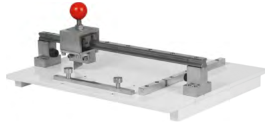
ECT & PAT Sample Cutter (PN-ECC25)

It is used for cutting paper sample for doing RCT (Ring Crush Test)