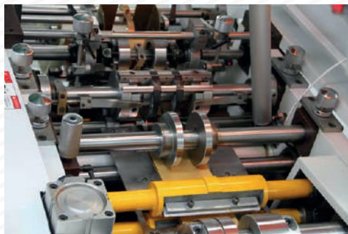
Paper Bag Cut Off