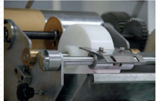
Paper Bag Gluing