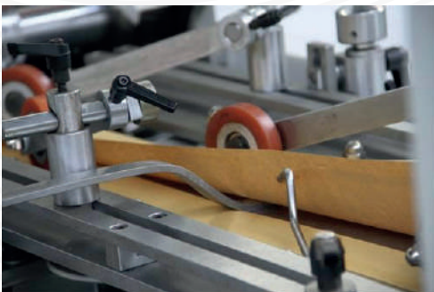
Paper Bag Forming