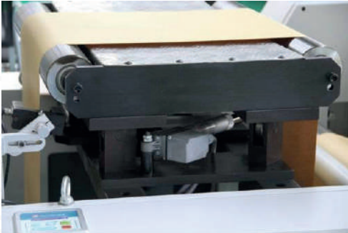
Deviation Correction System